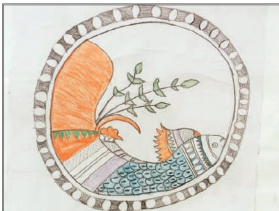
Ramya G8 Beta